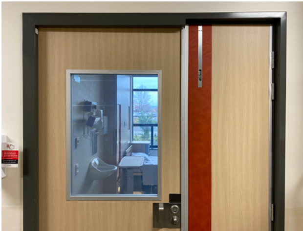
iGlass vision panel switched off

Hallmark doors can be fitted with vision panels using iGlass electronic blind technology, providing privacy and hygiene benefits. iGlass Privacy replaces the need for venetian blinds or curtains which require ongoing cleaning or laundering. Switching can be by touch, switch, motion or voice.