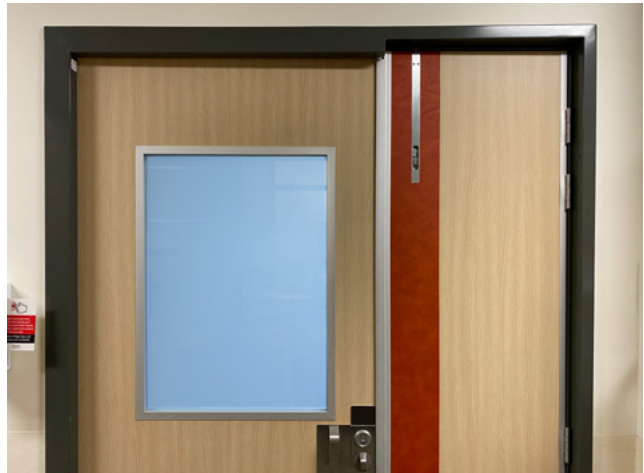
iGlass vision panel switched on